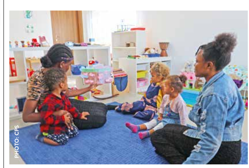
Learning by playing: Montessori nursery in Fumba Town

The Montessori Kindergarten in Fumba Town started successfully but now needs support.