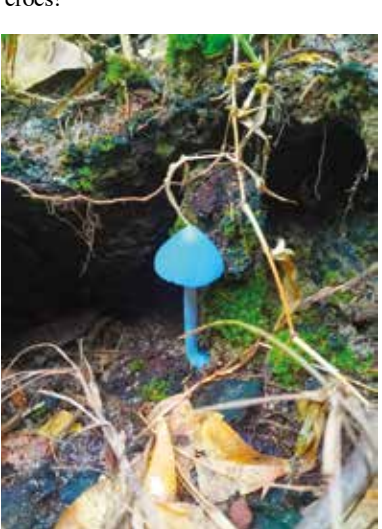
Blue mushrooms? Yes, and pink and orange ones, too. Are they eatable? Better not, says the guide

For us it was a lovely day out, something a bit different, easy to access and not very busy. The forest also has a few "picnic sites" and there is a plan for a zip line later. A word to the wise - I wouldn't wear