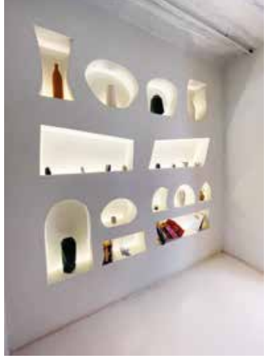
Swahili lime plastering meets Scandi style at the new Karafuu in Stone Town