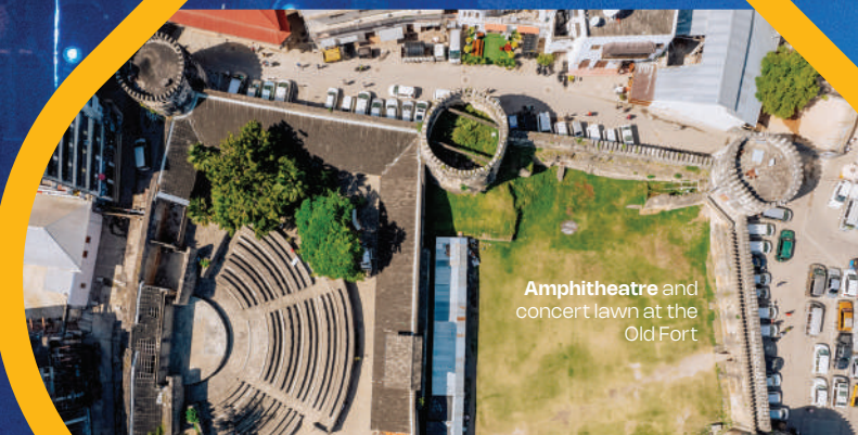
Amphitheatre and concert lawn at the Old Fort

Explore the sounds of the 21st Edition of Sauti za Busara festival happening from the 9-11th February 2024 in Zanzibar at the Old Fort, built by the Portuguese and Arabs more than 300 years ago. The site is part of UNESCO-protected Stone Town, a unique gem right by the Indian Ocean.