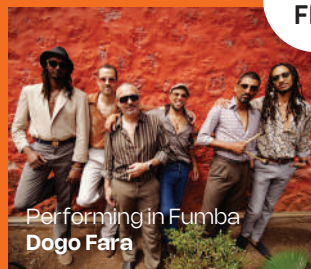
Performing in Fumba Dogo Fara

Saturday marks a special Busara+ satellite day in Fumba Town with 3 live performances , the popular monthly Kwetu Kwenu outdoor market and other attractions in Zanzibar's first green neighbourhood. At night you can return to the festival. Welcome!