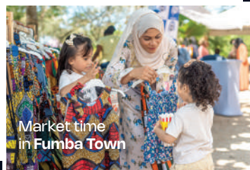
Market time in Fumba Town

Get in touch: fumba.town Ph. +255 623 989 900